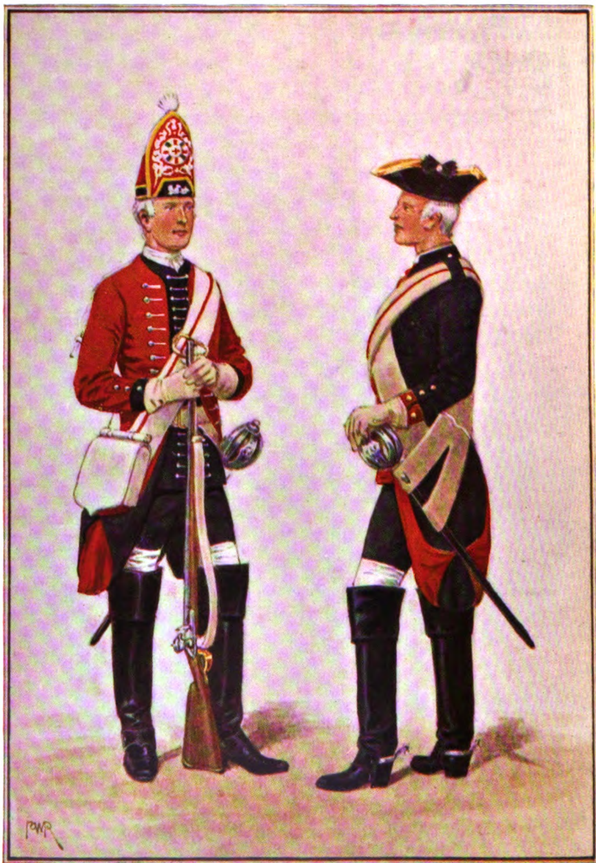
From a Water-colour Drawing