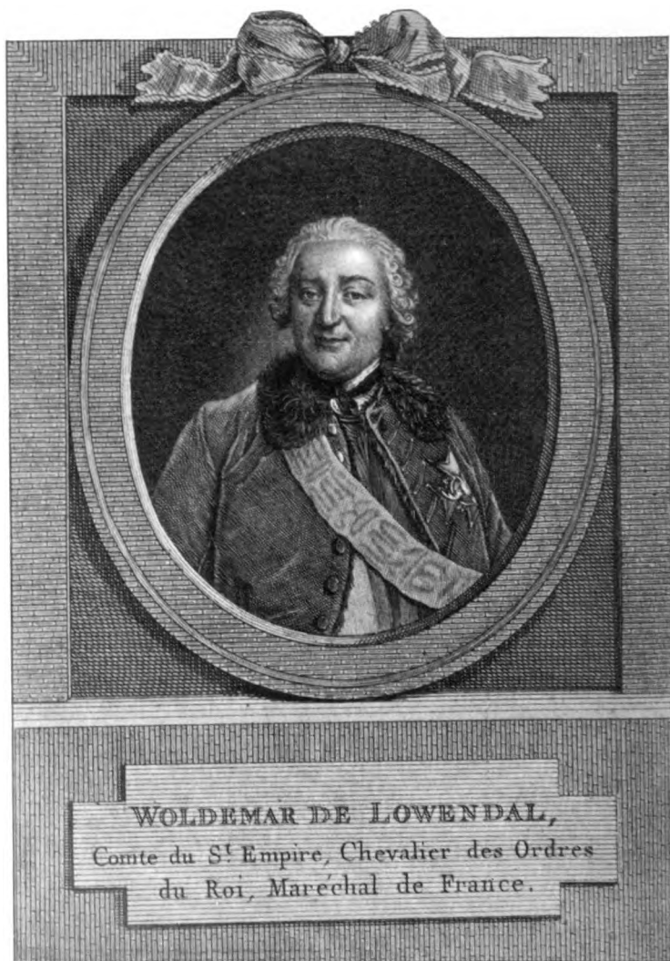
WOLDEMAR DE LOWENDAL, Comte du S t Empire, Chevalier des Ordres du Roi, Maréchal de France.