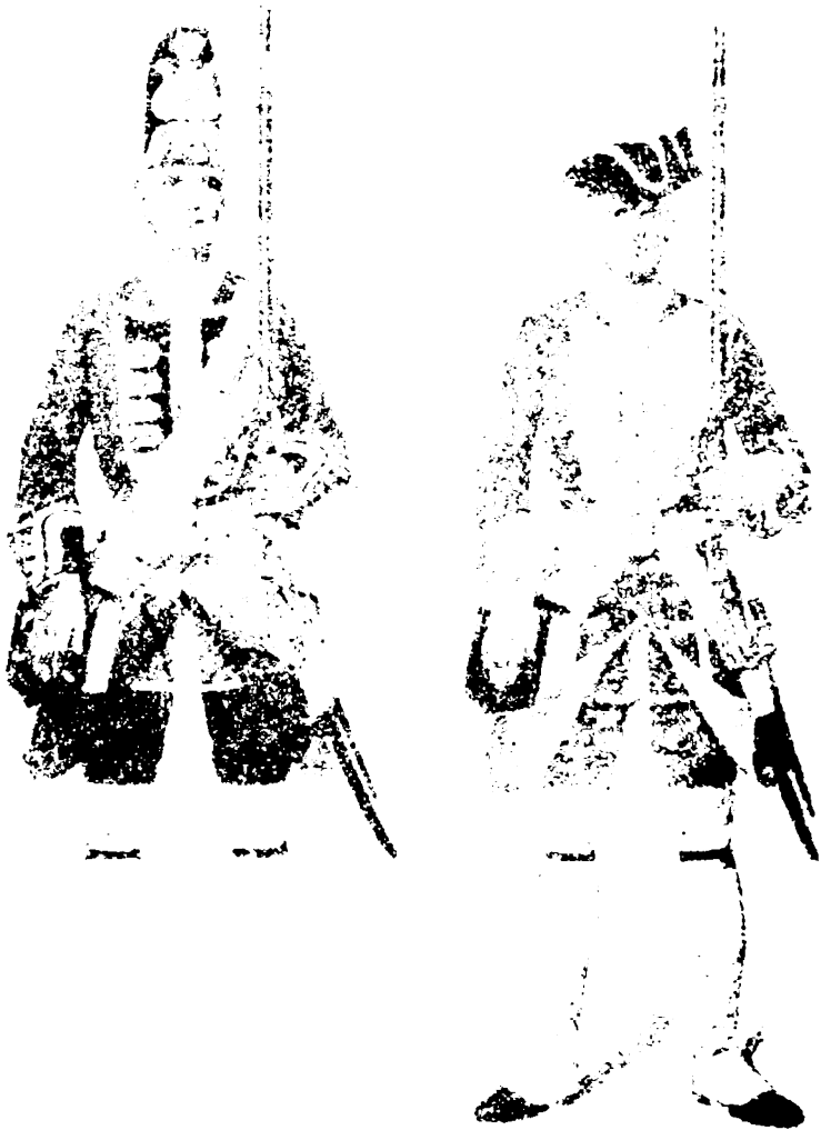
OFFICERS IN THE 4th SUFFOLK REGIMENT, 1914