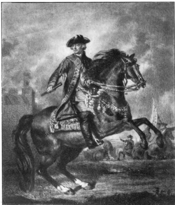
FIELD-MARSHAL EARL LIGONIER.

FROM AN ETCHING BY S. W. REYNOLDS, AFTER THE PORTRAIT BY SIR JOSHUA REYNOLDS IN THE NATIONAL GALLERY.